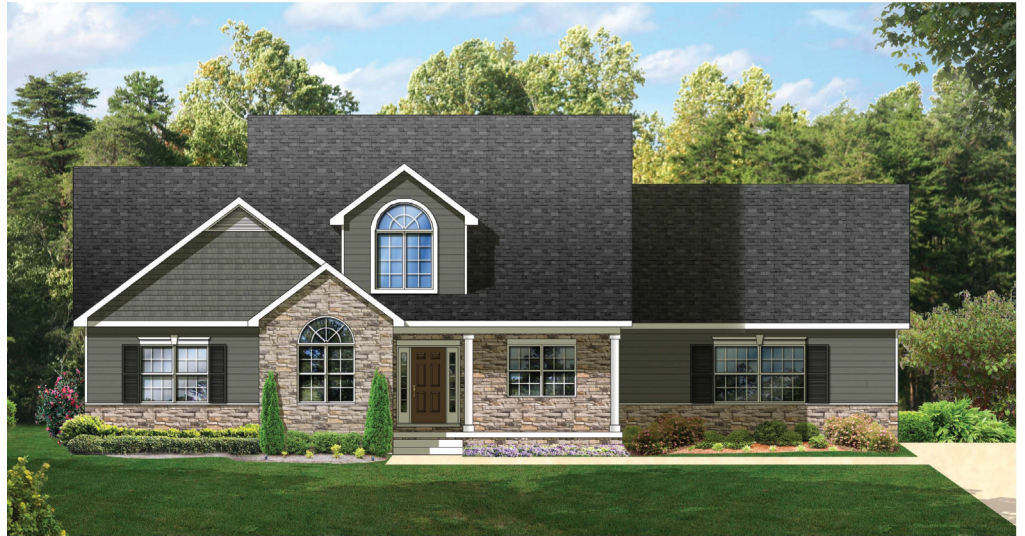
Elevation and house plan is the exclusive property of Impact Development Group, Inc. and may not be reproduced. Copyright © 2015. All Rights Reserved.

$369,500 | 4 bedrooms 2.5 baths | 2 car garage